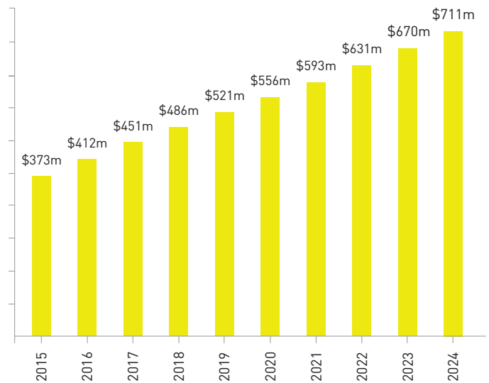
Figure 2. Estimated total annual payments costs faced by NZ retailers.*

* Assumes merchant service fees for: Credit 1.4%, Contactless debit 1%. If banks and card companies were to introduce fees on non-contactless debit in 2019, a possible scenario based on overseas trends identified in the Covec research, the fees would be $992 m per annum by 2024.